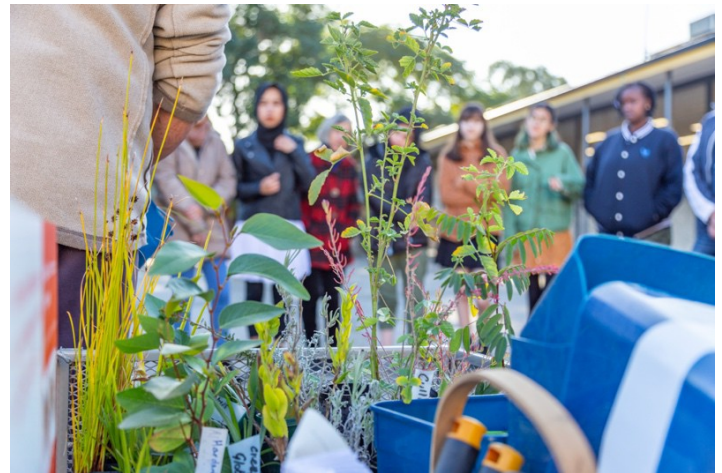
Planting workshop on 5 June 2020

The planting workshop introduced students to a range of native species that attract butterflies by providing food for caterpillars and nectar for butterflies. Students learnt how to prepare the space for new plants, how to dig an appropriate hole, use the correct soil treatment, carefully remove seedlings from their casing, and plant them.